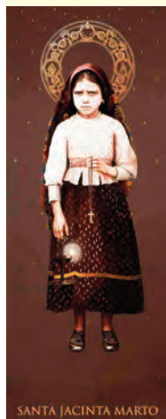
SANTA JACINTA MARTO

Note: Veneration of the Relics of SS Jacinta & Francisco/ Fatima Devotions/ Recitation of the Rosary/ Enrollment & Investiture in the Brown Scapular will be available & facilitated until the cathedral closes at 23.00