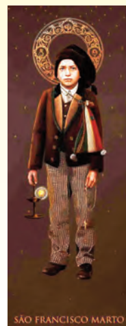
SÃO FRANCISCO MARTO