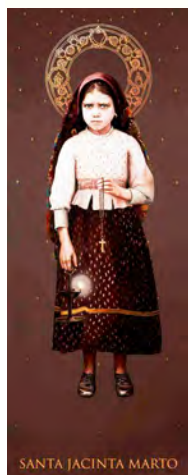
SANTA JACINTA MARTO