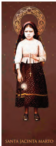
SANTA JACINTA MARTO